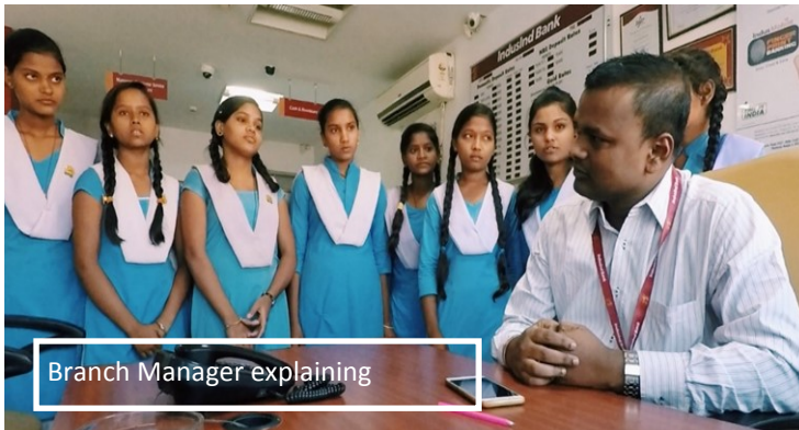
Branch Manager explaining

In the bank’s neighbourhood, many customers are not educated, nor do they know how to read or write. The students have been a wonderful addition to his workspace; they patiently try to understand the customers problems, aid them in the completion of their bank forms, and provide an excellent customer experience.