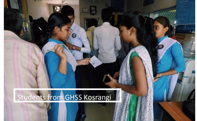
Students from GHSS Kosrangi

Students are empowered to create their own future; to exceed their potential in the classroom, in the world, and beyond. The stories shared by students below illustrate the power of skills education in LAQSH's banking, financial services, and insurance (BFSI) programs in Chhattisgarh.